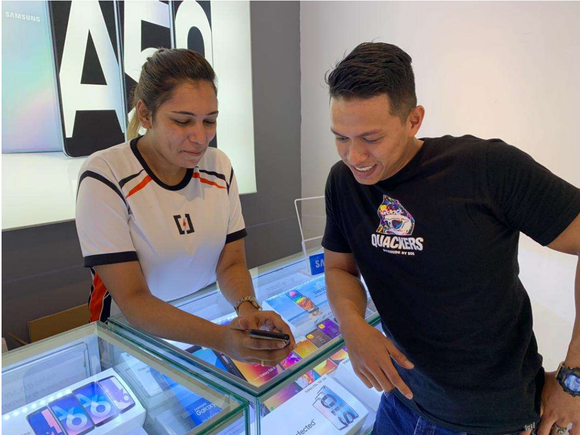
Customer registering for InstaProtection when buying smartphone